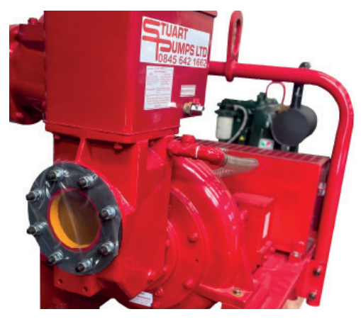
Part of Stuart Group Ltd