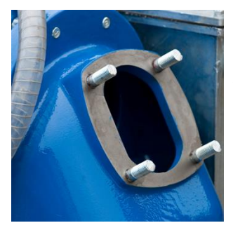
Large inspection covers Easy access to float box, impeller and non-return valve.

Fully integrated in the canopy for easy operation throughout the evening and night.